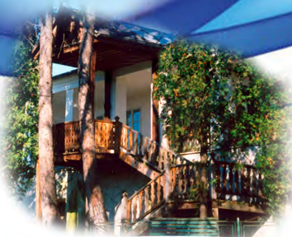
"Ion Borcea" Memorial House