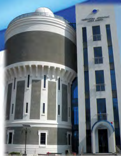
"Victor Anestin" Astronomical Observatory